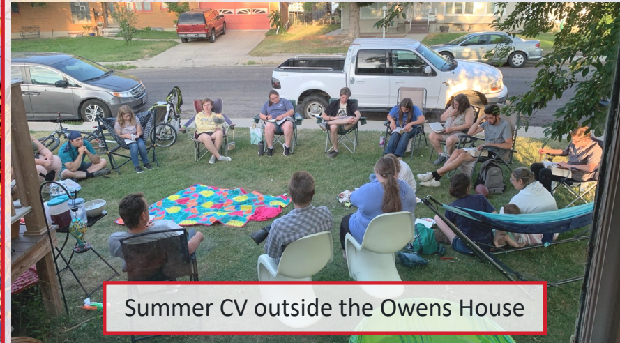
Summer CV outside the Owens House

Porches and back yards were the place to be this summer as students who stuck around Casper gathered to dig deeper in God's Word. We didn't have a theme or a specific book, but what we did have were hungry minds looking to learn how to feed themselves from the food Jesus says He has in Matthew 4:4. The people coming were so eager to grow, we handed the wheel over to them, and each week one of them would study a topic they wanted to learn more about and lead the Bible study on it. Topics included conflict resolution, depression, being the light Jesus called us to be in dark places, and the