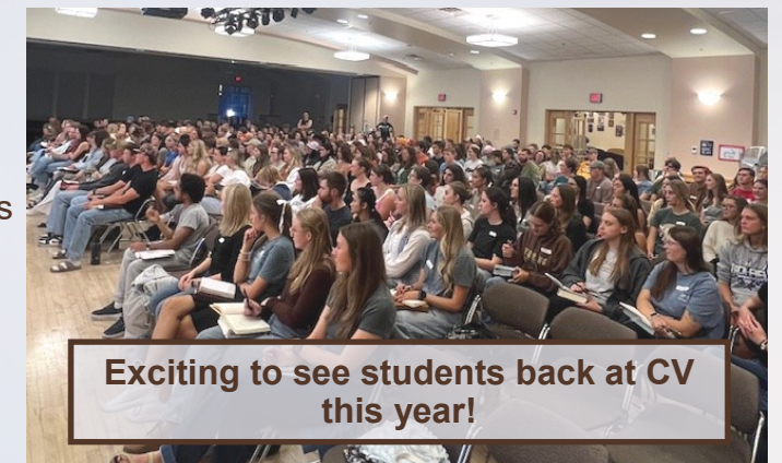
Exciting to see students back at CV this year!