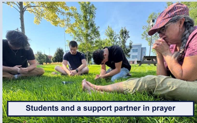
Students and a support partner in prayer

On August 14, a week before freshman move in, a group of students, CV staff, and a support partner gathered on campus to come before the Lord in prayer. As we formed a circle in the grass between the library and the classroom building and spent a full hour praying, one after another without pause. It was such a blessing to hear these students earnestly asking God to draw them closer to Jesus, to use them to build His kingdom and to make them bold to share the gospel with their classmates and friends. As this year has started, it is evident that God is answering prayer. So many students are open and seeking. We pray that these students will come to saving faith and be disciplined through Campus Ventures this year!