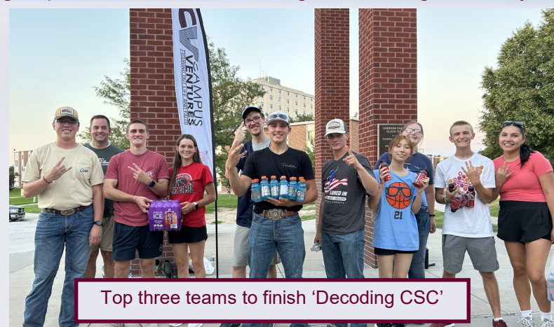
Top three teams to finish 'Decoding CSC'

On August 18, we held an event called 'Decoding CSC.' We gathered a group of students and gave them a list of obscure locations to find around Campus. Pictured here are the three teams who finished the task fastest, each including some of our returning CV students and some freshmen. Last spring, we trained a group of six freshmen in evangelism through our very first Leaders in Training (LIT) Team. We invite you to